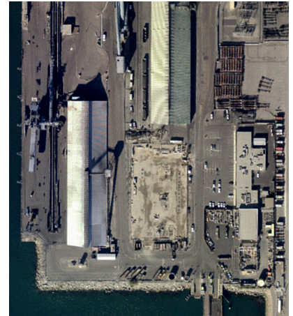
Detect and identify vehicles such as trucks and service vehicles. Simulated image.