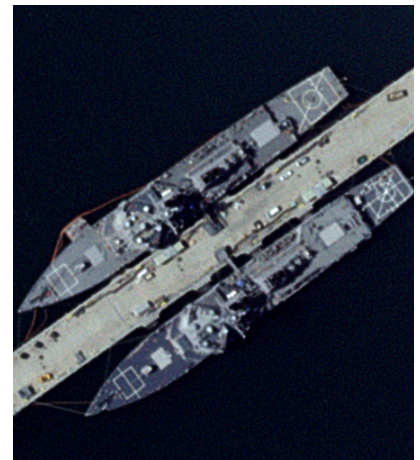
Very high-resolution imagery supports detailed analysis of vessels at port. Simulated image.